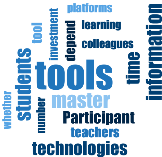
Fig. 4. Word cloud of the third dimension