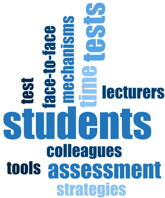
Fig. 5. Word cloud of the fourth dimension Source: elaborated by the authors using the MAXQDA 2022 software.

The summary of data and the analysis of the lecturers' perspectives on the use of e-learning tools allowed for a conclusion that the main objective of the remote teaching process was to ensure the transmission of knowledge in line with the expectations and needs of students.