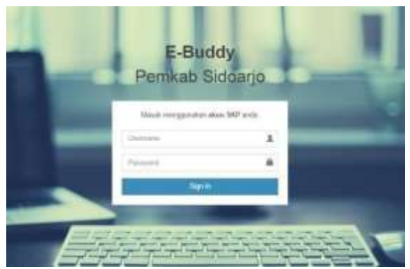
Figure 1. Sidoarjo E-Buddy Application Page.

Sidoarjo Regency OPD, starting from attendance, activities, meetings, approval of official letters, disposition of official letters, to correspondence related to the Regional Government. This application also helps processing existing information through the integration of one data in a dashboard, so that other agencies under it can more easily see activities or activities in a more transparent manner, one of which aims to facilitate and speed up official correspondence activities. Administrative needs are facilitated more effectively through the outgoing and incoming mail features which are also equipped with details of each letter and its development status. The legal basis for making the E-Buddy application is based on Sidoarjo Regent Regulation Number 30 of 2020 Concerning the Administration of Electronic Service Manuscripts.