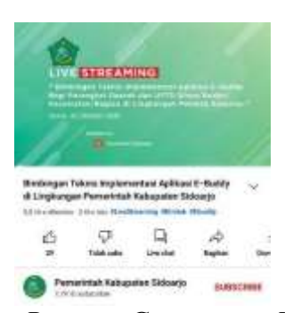
Figure 3.Technical Guidance for the Implementation of the E-Buddy Application in the Sidoarjo Regency OPD Environment

the E-Buddy application. Regarding the implementation of the E-Buddy application in the Kajeksan Village Government, the delivery of information regarding the clarity of using the E-Buddy application was delivered by the Regional Secretariat of the Sidoarjo Regency Government through the use of the "Contact Developer" feature contained in the E-Buddy application. From the research results, the admin revealed that using this feature when experiencing problems in terms of setting letter numbering that is not sequential. In addition, to clarify the technical guidance for the E-Buddy application, the Kajeksan Village Government can replay the previous socialization video on the Sidoarjo Regency Government's YouTube channel.