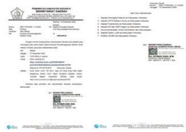
Figure 2. E-Buddy Application Technical Guidance Invitation.

The communication dimension is part of implementation in order to provide program policy information so that it can be conveyed by all target parties(Laili & Choiriyah, 2021). Communication plays an important role for the ongoing coordination of policy implementation(Mandala et al., 2016). According to Edward III a public policy will be implemented properly and effectively if there is effective communication between policy or program implementers and stakeholders. With communication, the goals and objectives of a policy can be socialized properly so as to avoid distortion or rejection of the policy. Policy communication itself has several dimensions, including the dimensions of transmission, clarity and consistency. (Fitrianingrum et al., 2020). In the transmission dimension, each program needs to be conveyed properly so that the target actors can understand and know the purpose of the program (Sekarningrum et al., 2021).