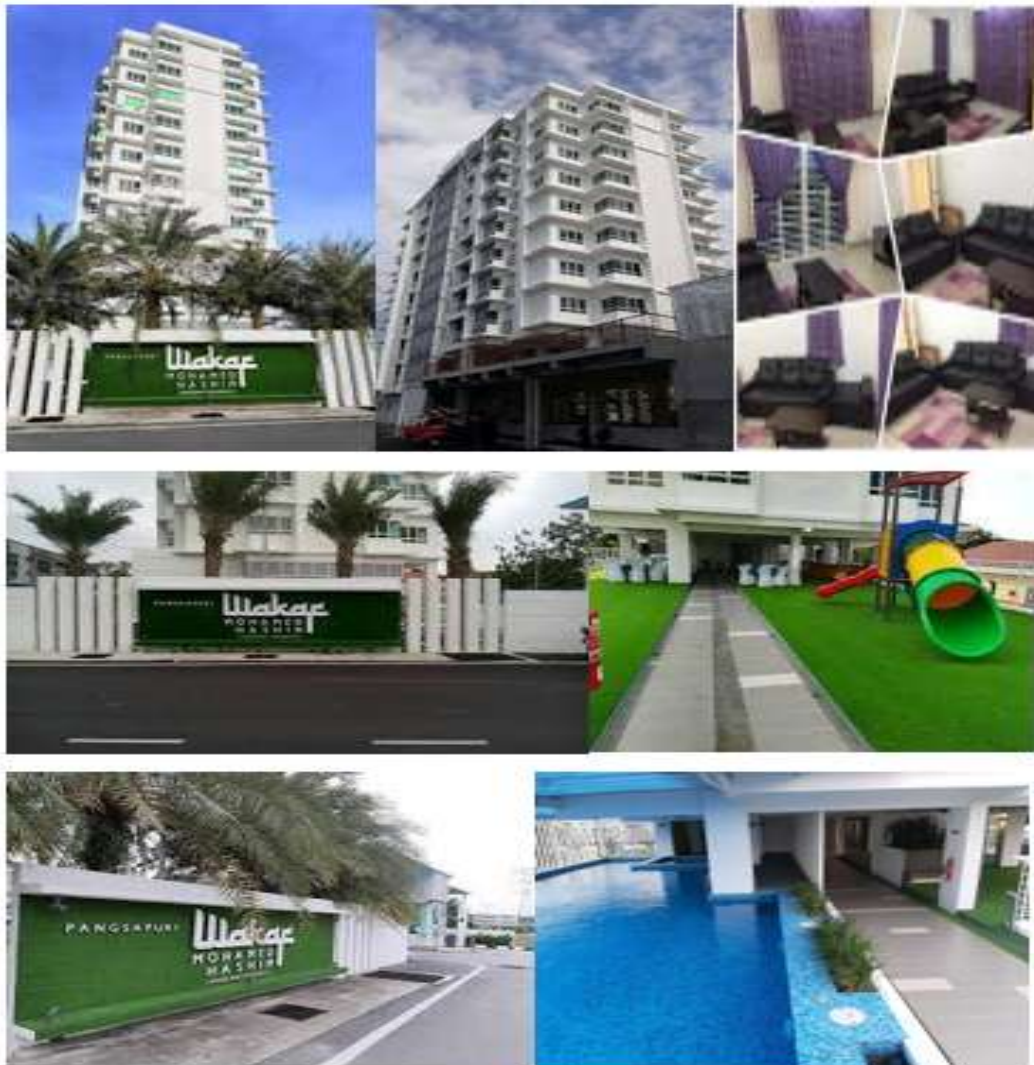
Figure 6:- Outcome Projects of Mohamed Haji Hashim Waqf Land Development.