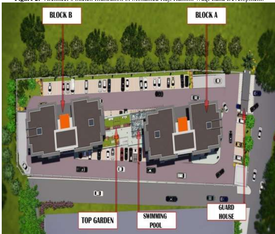
Figure 2:- Architect's Sketch Illustration of Mohamed Haji Hashim Waqf Land Development.

MAINPP has collaborated with developer, UDA Holdings Berhad to develop this land. This development is also known as Seberang Jaya Legacy or SJ Legacy in conjunction with the name of the housing projects developed in collaboration with developer UDA. With assets worth RM 22 million for the development process, the rental income on this waqf land can generate an income of RM15,000 per month. The total cost of the development of this waqf land is RM17 million, consists of 2 blocks of 68 units of medium cost apartments that have been developed with several public facilities for each residential unit such as 2 units of parking, multipurpose hall, swimming pool, surau and many others. This apartment is located at Lot 192 Mukim 1, Seberang Perai Tengah (Seberang Jaya). Aside from, this development project has given a return of RM 4 million to the developer, UDA Holdings Berhad. Meanwhile, MAINPP received a return of RM 3.3 million, which consists of 9 residential units. The project was completed on 26 September 2018, while the apartment was first occupied in October 2018. Figure 2 is the architect's sketch illustration of Mohamed Haji Hashim's Waqf Land development and Figure 3, represents the illustration of Mohamed Haji Hashim's Waqf Land development. While, Figure 4 is a summary of Mohamed Haji Hashim's Waqf Land development project.