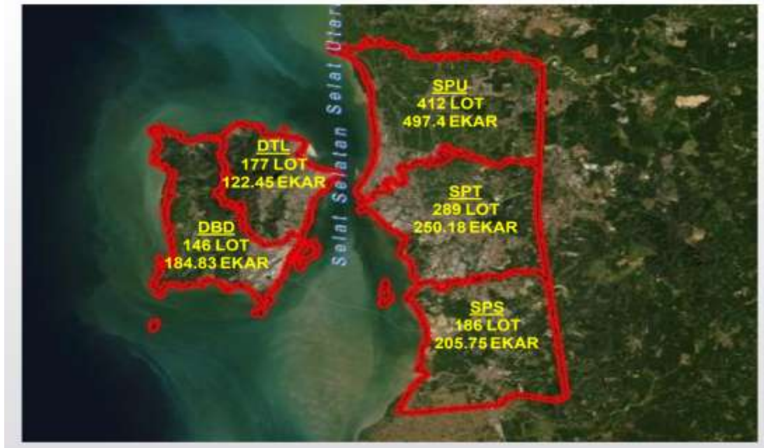
Figure 1:- Penang Waqf Properties by 2020.

Waqf in Penang is governed by Penang Islamic Religious Council (MAINPP) and was divided into two primary divisions by MAINPP, namely Seberang Perai and Penang Island. The Northeast, Southwest, North Seberang Perai, Central Seberang Perai and South Seberang Perai are the several districts located in each of these divisions. Figure 1 represents the divisions of each waqf property according to lots and acres. By 2020, it was reported that Penang has 1210 lots or 1260.61 acres waqf properties.