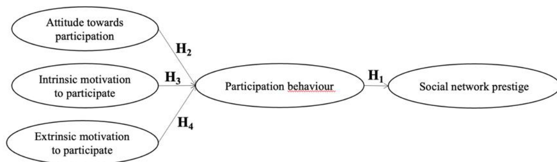
Figure 1. Theoretical model of factors influencing social network prestige in online peer assessment