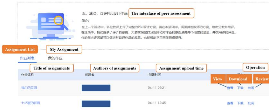
Figure 6. Interface for assignment display