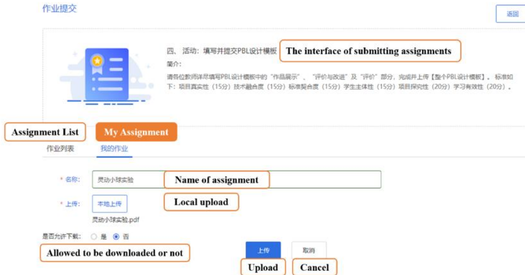
Figure 5. Interface for submitting assignments

In this course, learners could first study the learning materials in the form of video and text in the platform, complete the corresponding assignments and submit them according to the requirements (as shown in Figure 5). Then, in the peer assessment, they could select other learners' work from the assignment display, score it according to the evaluation scale and give comments (as shown in Figure 6). Each learner was free to choose the work they wanted to evaluate, and all participants were advised in the course guide to evaluate approximately 10 assignments. The evaluated learner could view the learning feedback, including scores and comments given by other learners.