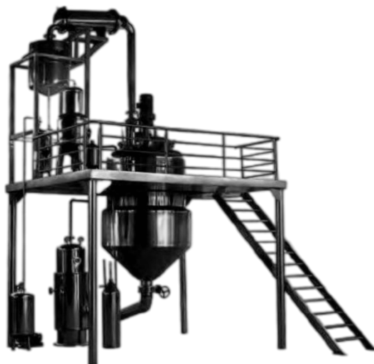
Fig. 4 Product legend

and condensing device together, which reduces the temperature of the scale tube, so that some volatile substances with low boiling point can be condensed effectively in time, without the temperature being too high to cause their volatilization. At the same time, it condenses the volatile oil with high boiling point quickly, and the part connected with the gas guide slope tube is within the length of the condensation tube outside the collection tube, so that the sample collection tube can be condensed effectively.