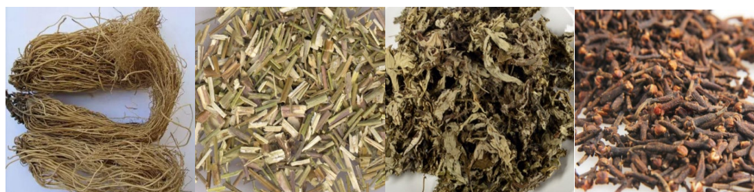
Fig. 3 Picture of traditional Chinese medicine

The extracted volatile oils of litsea cubeba, eupatorium adenophorum spreng, thyme, fennel, atractylodes rhizome, menthae herba and cinnamon have a certain inhibitory effect on the bacteria both in the air and in the respiratory tract. The volatile oils are mixed with a special proportion to give full play to the disinfection and bactericidal effect of Chinese medicine disinfection bead.