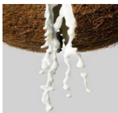
Figure 1 Santan

Basically, coconut milk is an oil - in - water emulsion, stabilized by some proteins existing in the aqueous phase. [4]. The main component of coconut milk is coconut oil, it account for 38% by weight. Coconut oil is naturally saturated, about 92% consists of saturated fatty acids., mainly are medium chain fatty acids (MCFA). About 50 % offatty acid in coconut oil is lauric (CI), for this reason, it is called the "lauric oil" [5].