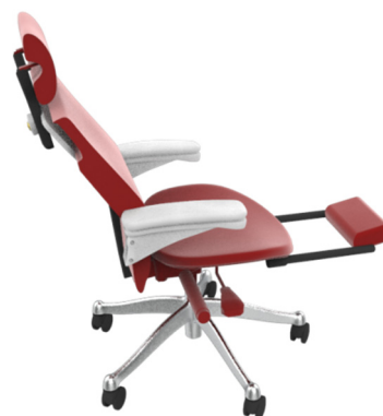
Figure 6. Leisure mode