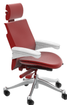
Figure 5. Office mode

regularity. If you stay in the same sitting posture for a long time, you will experience discomfort such as waist pain and fatigue. Therefore, the office chair needs to meet both office and leisure functions. On the basis of meeting the relevant size requirements determined in the previous stage, the final scheme (above Table 1) realizes the connection between the armrest and the backrest, which can be angled with the backrest; the backrest angle can vary from 85 degrees to 165 degrees. Achieve a tilt angle of 85 degrees to 105 degrees for the working mode; 105 degrees to 135 degrees for the leisure mode; 135 degrees to 165 degrees for the rest mode.