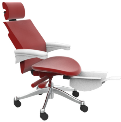
Figure 7. Storage box design