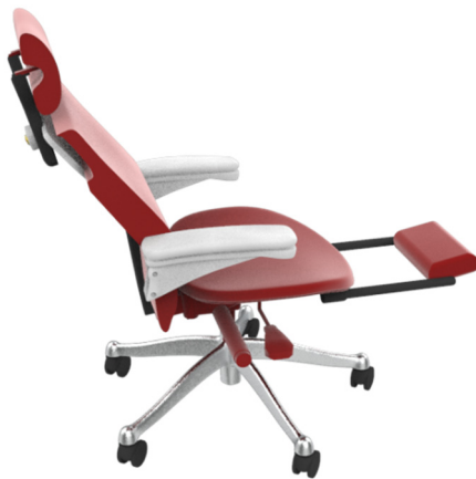
Figure 8. Foot support design

the scale design of seat furniture based on human dynamic factors. Aesthetic technology ,7:184-208.