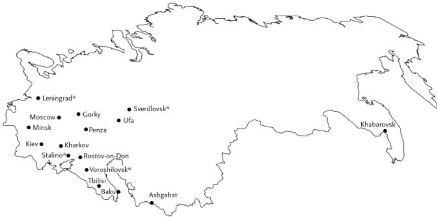
Fig. 4. Map of phage research in USSR, c. 1940, based on conference contributions and journal articles. * Names are given as of 1940: Leningrad is now St. Petersburg, Sverdlovsk is Ekaterinburg, Stalino is Donetsk, and Voroshilovsk is Stavropol’.