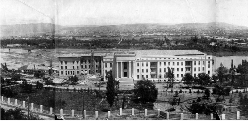
Fig. 2. Construction of the Tbilisi Institute of Microbiology, Epidemiology, and Bacteriophage on the bank of the Kura river in Saburtalo, Tbilisi, c. 1939.