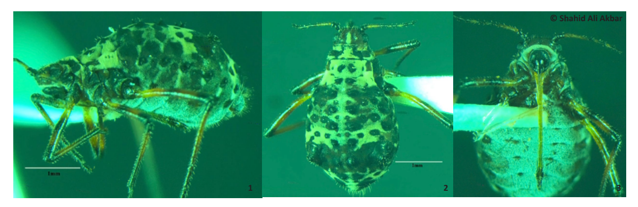
Images 1-3. Pterochloroides persicae - viviparous female: 1 - Body in lateral view; 2 - Body in dorsal view; 3 - Head in full-face view (not to scale).