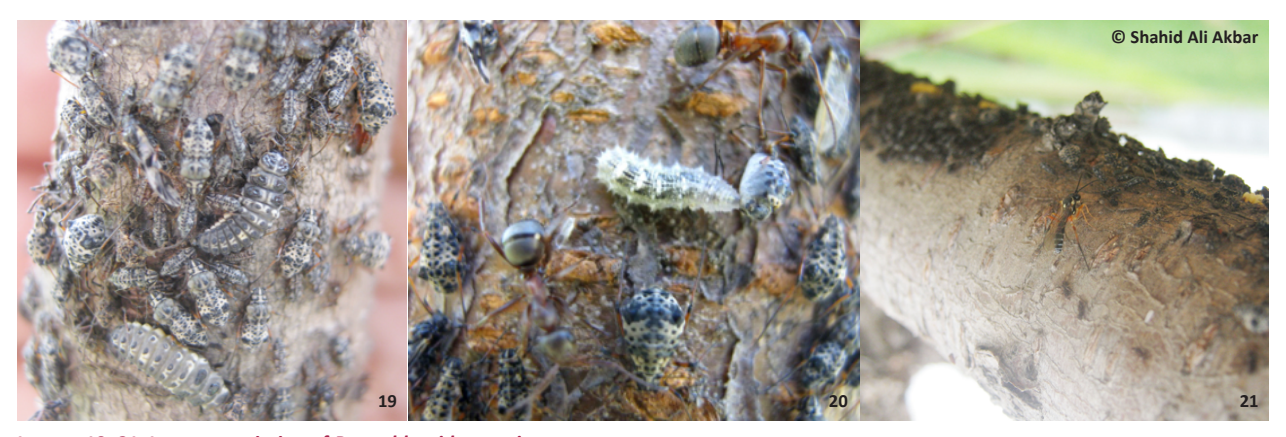
Images 19–21. Insect association of Pterochloroides persicae 19 - Adalia tetraspilota nymphs feeding on the pest; 20 - Syrphid fly grub feeding on the pest; 21 - unidentified parasitic hymenoptera ovipositing on aphids.

pest; after 15 days pest population remained minimal in rosemary oil + soap solution (@ 0.1ml+10ml /litre of water) whereas negligible resurgence was observed in other combinations which also subsided to zero in following weeks. These chemicals were responsible for causing membrane disintegration on contact and the repellant nature of the spray also dispersed the surviving aphids (Image 18). The data generated is under evaluation for further use and recommendation. Some of the prominent coccinellids found associated with the aphid during the study were Hippodamia variegate (Goeze, 1777), Oenopia conglobata (Linnaeus, 1758), Priscibrumus uropygialis (Mulsant, 1853) and Adalia tetraspilota (Hope, 1831). Several un-identified parasitoids, syrphids, Vespa sp. were also seen frequently associated with the nymphs and adults of the alien species (Image 19-21). The aphid was also seen predominately attended by Formica sanguinea Latreille, 1798 for its honey dew.