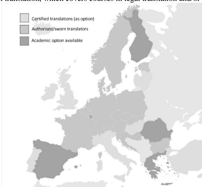
Fig. 1. Geographic distribution of systems for certified translations, state authorised sworn translators and academically authorised sworn translators (Pym et al. 2012, 29).