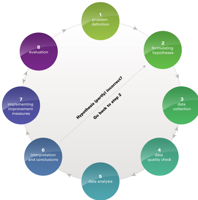
Fig. 2 The eight steps of the data use intervention (Schildkamp & Ehren, 2013, p. 56)

schools ownership about the process and makes educators active agents for data use (Bryk et al. 2015).