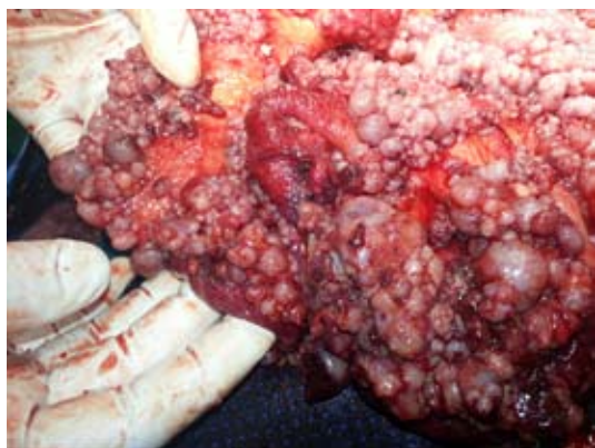
Fig. 5. High tumour aggressiveness