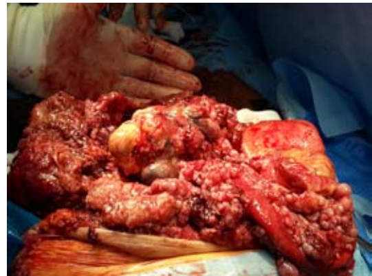
Fig. 2. Solid-cystic appearing GIST filled with blood