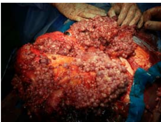
Fig. 3. Disseminated GIST