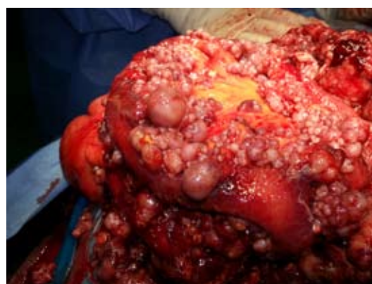
Fig. 7. High mitotic index of the neoplastic cells

Stromal tumors are rare. Epidemiologically they account for 0.1-3% of all gastrointestinal tumors. Stromal tumors may be potentially found in any segment of the gastrointestinal tract. A malignant course of the disease with direct infiltration and metastases via the blood