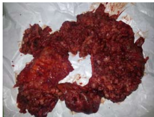
Fig. 6. Resected hernia sac with gastrocolic omentum

dissemination was reduced, which covered the inner surface of the abdominal cavity. Radical resection of all macroscopic lesions was unrealizable (fig. 7). The abdominal wound was closed layer by layer. A 24 Fr Redon pelvic drain was placed in the abdominal cavity. The subcutaneous tissue in the umbilical region was secured with a 14 Fr Redon drain.