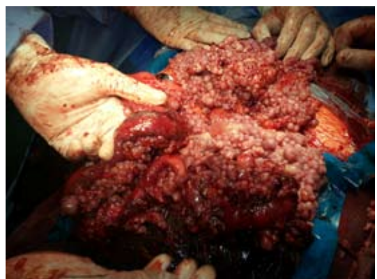
Fig. 4. Neoplastic involvement of the small intestine