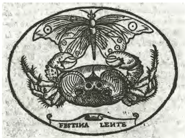
Figure 1: Augustus Caesar’s Crab and the Butterfly