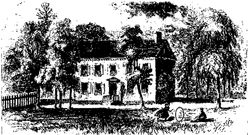
THE FICELI\GHUYSEK HOMESTEAD.

(TOP) The Repeal, or The Funeral of Miss Ame-Stamp— pro-American cartoon on the repeal of the Stamp Act, issued in London and Philadelphia. Typical of the shift from anti-Catholic to anti-Anglican sentiment