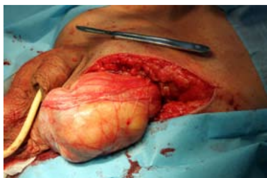
Fig. 2. Hernial sac with urinary bladder content

Intraoperative blood loss was insignificant. During the procedure bipolar electrocoagulation was used, due to the presence of a cardiac