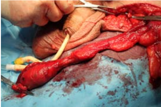
Fig. 4. Dissected left testicle with elements of the spermatic cord