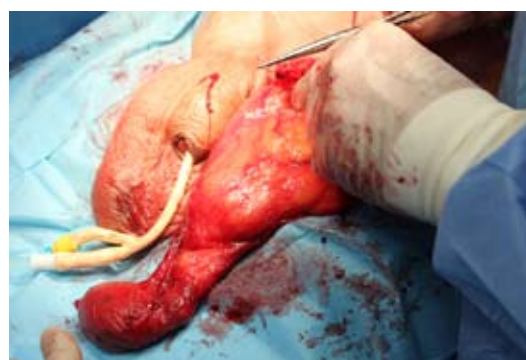
Fig. 3. Dissected hernial sac and urinary bladder and isolated left testicle