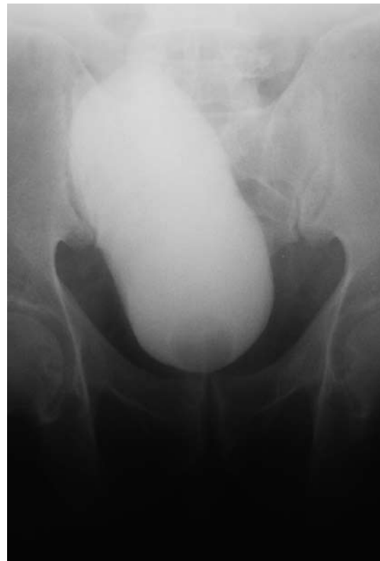
Fig. 6. Control cystography 30 days after surgery

in general surgery around the world. It is estimated that each year approximately 20 million of such operations are performed. In Poland, there are more than 40 thousand such procedures performed. For comparison, in the United States there are more than 700 thousand such procedures. Inguinal hernia surgery predominates, accounting for 70% of cases. The second most frequent surgical interventions concern femoral hernias in the female population, accounting for 12% of cases (8).