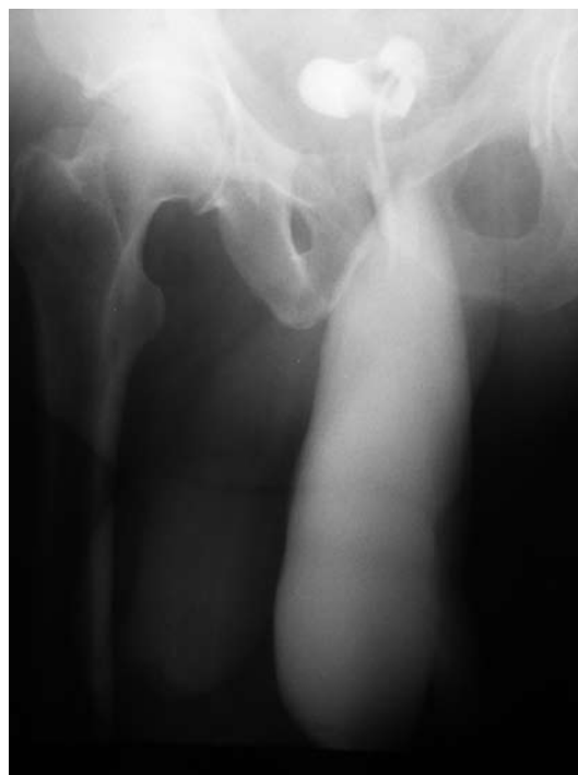
Fig. 1. Preoperative ascending cystography

The inefficient posterior wall of the inguinal canal was supplied by redoubling the