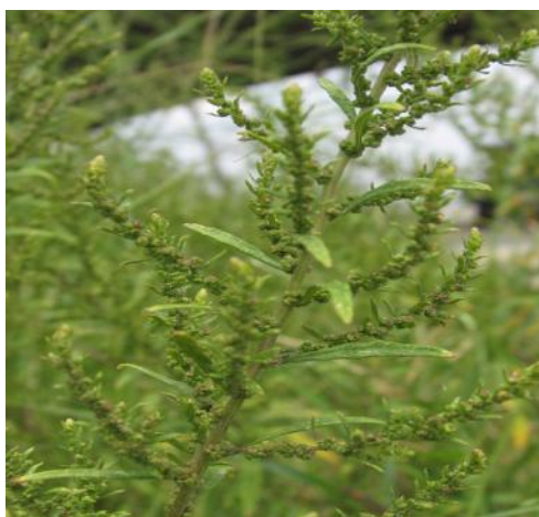
Fig. 1. Flowering Chenopodium ambrosioides (Orginal)