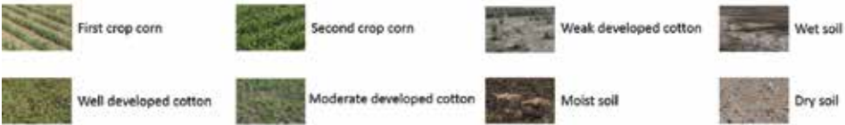
Fig. 2. Crop types

RapidEye was launched in 2008 with a primary focus of agricultural, environmental and cartographic applications 16,17 . Blackbridge, the provider of RapidEye imagery, offers RapidEye data at three different processing levels. The imagery was obtained in Level 3A (RapidEye Ortho product) processing level in which radiometric, geometric and sensor corrections were applied. The RapidEye data provides five spectral bands which are blue (440–510 nm), green (520–590 nm), red (630–685 nm), rededge (690–730 nm) and near-infrared (760–850 nm) (Ref. 18).