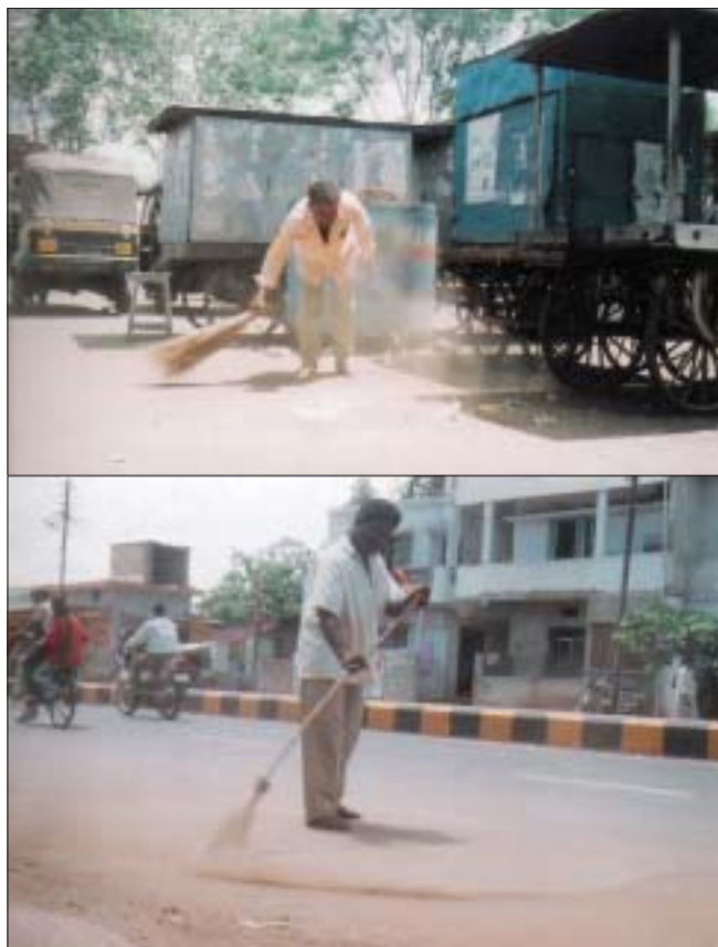
Figure 1: Street sweeper at work, not using any protective devices