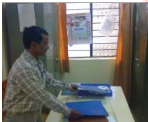
Figure 2: Class IV worker in office building

working in a randomly selected zone (Hanumannagar Zone) of Nagpur Municipal Corporation, Nagpur; the comparison group comprised all class IV workers working in the office buildings of Nagpur Municipal Corporation, Nagpur.