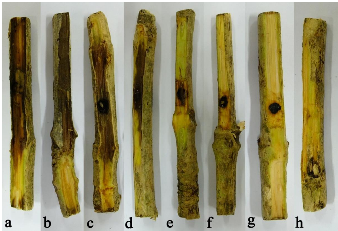
Fig. 2 – Lesion developments after 7 days of inoculation of each mycelium plug. a Lasiodiplodia brasiliense (MFLUCC 11-0414). b Lasiodiplodia pseudotheobromae (MFLUCC 12-0796). c Lasiodiplodia pseudotheobromae (MFLUCC 12-0772). d Lasiodiplodia pseudotheobromae (MFLUCC 12-0053). e Barriopsis tectonae (MFLUCC 12-0381). f Dothiorella tectonae (MFLUCC 12-0382). g Sphaeropsis eucalypticola (MFLUCC 13-0701). h Control.