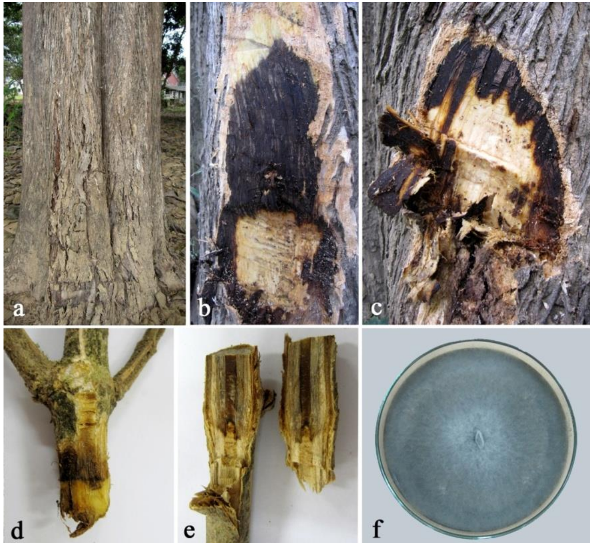
Fig. 1 – Symptoms associated with Lasiodiplodia pseudotheobromae . a Cracking of bark and cankers spreading from base of tree. b, c Black discolouration of the inner bark. d, e Twig dieback. f Seven-day-old colony of L. pseudotheobromae (MFLUCC 12-0796) on MEA isolated from a trunk cankers symptom.

(2009). Collected short twigs (2 cm diam.) were cut into pieces of 12 cm long. Surface disinfested in 70% ethanol for 30 s, 0.35% NaOCl for 2 min and 70% ethanol for 30 s. A small lateral incision was made through the bark and cambium layers with a sterile scalpel. Our tested species did not produce spores in culture. The agar plug inoculation method (Chen et al. 2014, Xu et al. 2015, Guan et al. 2016) is therefore used in this study. Agar plugs with 0.1 cm 3 diameter containing a thick layer of nutrient were cut from the edge of each actively growing colony and placed on each wound. Inoculated wounds were covered with a strip of Parafilm to prevent desiccation of the plug. Sterile MEA plugs were used as controls. Inoculated twigs were incubated in moist chambers at 27°C for seven days. There were five replicates for each isolate and the control. The lesion developments were measured with a ruler for statistical analysis and then photographed. Fungi were re-isolated from the advancing edge of twig lesions and sequenced.