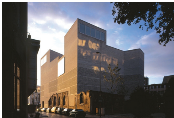
Figure 6 Peter Zumthor: Kolumba Museum- Köln, Germany (online Woodman, E. 2010: http://www.core.form-ula.com/2007/12/17/2074/ )

The strength of a good design lies in ourselves and in our ability to perceive the world with both emotion and reason. A good architectural design is sensuous. A good architectural design is intelligent.