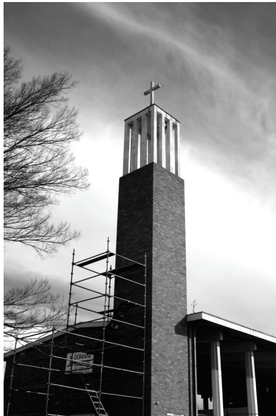
Figure 5 Wanda Verster, NG Kerk Monument , 2011, Digital Photograph

The emotional resonance a photograph can have is also proven in the case of the Monument Dutch Reformed Church in Bloemfontein. Even though the church had not had an active congregation for a number of years, the partial demolition and reuse of the building still evokes a sense of loss and many people in the surrounding areas photographed the process, as way of trying to establish a moment in time to aid their own memories. As time passes new elements, new meanings and experiences are revealed (Wilken 2009: 22) on a site as memory plays a more and more important role as events recede further into the past.