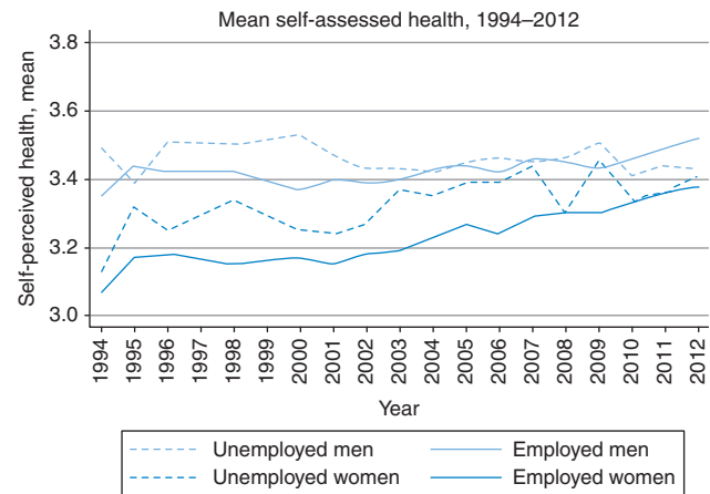
Fig. 2 Change in self-assessed health among unemployed and employed. The data for 1997 and 1999 are not available. The mean SAH among those unemployed seems to be higher compared with their employed counterparts, although in most periods the difference is not significant. This is most likely, because they are younger. After adjustment for individual- and household-level characteristics in the regression analyses, as shown in Table 2, 'being employed' status is a strong predictor of SAH.

Table 2 (part A) presents the results of the logistic regression of determinants of good SAH in the general population. Among males, good health was positively associated with age, being better educated, being employed, living in a larger household, a non-poor one and residing in a rural area. Among females, the pattern was similar, except that significantly better health began to be seen at lower poverty levels. When restricting the sample to those unemployed (Table 2, part B), among males, only living in a rural area and in a wealthier household were significantly associated with better health. Among females, age, residing in a rural area, living in a larger and wealthiest household were significant.