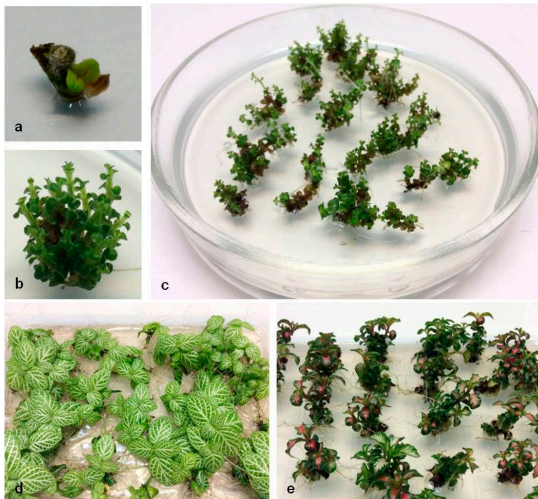
Figure 1 Fittonia albivenis multiple shoot formation on hormone-free MS/2 medium a – a stem fragment with axillary bud used as initial explant; b and c – formation of shoot clusters; d and e – in vitro rooted plants of the clones #2 (d) and #9 (e) ready to be transferred to the soil

results and the other published data shows that application of plant growth regulators seems just to shorten the time period of Fittonia in vitro microclonal propagation but does not have any significant effect on multiplication coefficients.