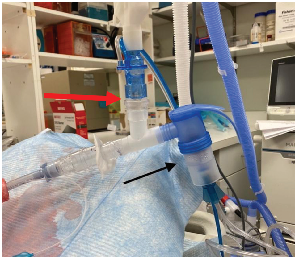
Fig. 3. The bottom black arrow indicates the location of the nebulizer in the ventilator circuit during Phase 2 of the experiment. The top red arrow in this image is the location of the viral filter to collect the simulated breath from the model.

The unweighted marginal means of exhaled viral quantity for the nebulization phases of the presence of a nebulizer and the absence of a nebulizer were 1.8 \times 10^5 ng/ \mu L ( SE = 4.6 \times 10^4 ) and 1.8 \times 10^5 ng/ \mu L ( SE = 5.0 \times 10^4 ), respectively.