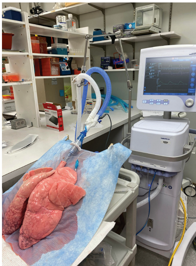
Fig. 2. Physical setup of the porcine model. The lungs are placed on a ramp to situate the lungs 30° relative to the bench surface. The connection between the ventilator circuit and the endotracheal tube is shown with the viral filter proximal to the endotracheal tube and distal to the Y-piece of the circuit connection. The background demonstrates the location of the mechanical ventilator used for the series of experiments.

desired alpha 0.05 and power 0.80 (3 degrees of freedom). All P values are given for 2-tailed tests.