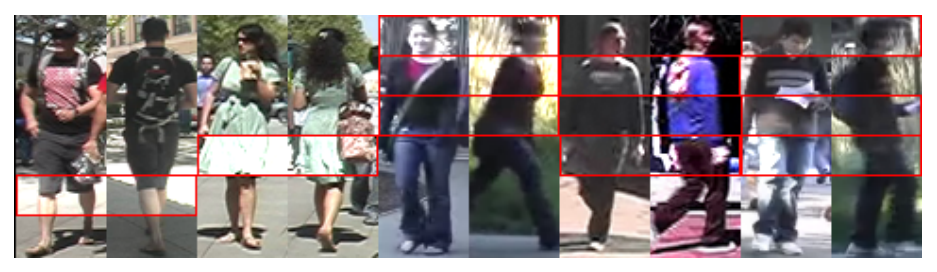
Figure 2: Strip selection results for attribute detection in VIPeR. From left to right: shorts , carrying , backpacks , logos , stripes .

Part selection As discussed in Section 2.2, we perform feature selection to choose the spatial parts (strips) used for detecting each attribute. Figure 2 illustrates the largely intuitive parts associated with some attributes. This result shows that not all features support each attribute, and that automated feature selection for spatially localised attributes is possible. Importantly, by reducing the feature space for each attribute, this also helps to alleviate the challenge of leaning from sparse data for each attribute.