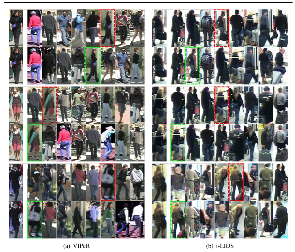
Figure 4: Examples where AIR (green) provides improvement in re-id rank vs SDALF (red).

identification [1], [5], [1] focus on high-dimensional low-level features which are assumed invariant to view and lighting. However, their simple nature and invariance also limits their discriminative power for identity. In contrast, attributes provide a low-dimensional midlevel representation which makes no invariance assumptions and can be measured reasonably reliably by a suitably trained detector. Importantly, although individual attributes vary in robustness, the combined and weighted attribute profile provides a strong discriminative cue for identity. This can complement and improve low-level feature based representations significantly. In developing a separate cue-modality and weighting strategy, our AIR is potentially complementary to most existing approaches, whether focused on features [1], or learning methods [12].