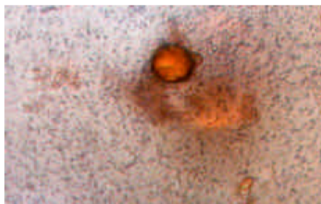
Fig. 2: Bacterial cells adhered to the crude oil

isolated from Pseudomonas aeruginosa (Zhang and Miller, 1992) and Pseudomonas putida (Tuleva et al. , 2001). The present observation is highly encouraging and this type of biopolymer has a greater advantage in oil industries and also in marine oil spill problems. Maximum biosurfactant concentration was found at the early stationary phase. This may be due to the production of biosurfactant as a secondary metabolite (Rahman et al. , 2002a). Rosenberg et al. (1979b) also found the accumulation of biosurfactant during the stationary phase in Arthrobacter RAG-I strain using hexadecane and ethanol as carbon sources. In the present study nitrogen fixation was found to be constant through out the period of study ( 4.2 \text{ mg L}^{-1} ). Similar kind of observation was reported by Deka (1998), in A. chroococcum strain isolated from an oil polluted soil. Degradation of crude oil was found to increase gradually with increasing cell number and incubation period, whereas in the case of nitrogen fixation it was found to be constant throughout the period of incubation. This might be due to the utilization of nitrogen during the growth and degradation process. Thus nitrogen fixing capacity is an added advantage, as the strain may be useful in cleaning the oil that spilled in nitrogen limited environments.