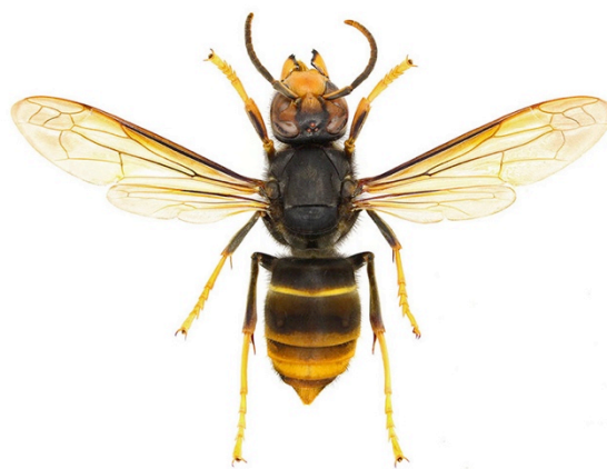
Fig. 2 A worker of the invasive hornet Vespa velutina ssp. nigrithorax , collected in Tsushima Island

Vespa velutina comprises several subspecies described [17–19]. The morphological features of workers collected in Tsushima indicated that they belong to the subspecies nigrithorax (Fig. 2) described by de Buysson, 1905. Although in its original description, de Buysson (1905) included Sumatra and Celebes, Indonesia as localities, I agreed the treatment by van der Vecht (1957) that the subspecies “ nigrithorax ” should be used for populations in continental Asia, e.g., India, Bhutan and China [19]. This is the same subspecies that has been evoking a number of problems in Europe and Korea.