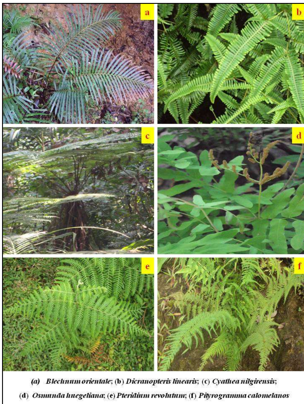
Figure 3: Notable pteridophytes in the study area

semicordata is a rare species in South India itself whereas C. nilgirensis is Near-threatened implying a high conservation status to them (Chandra et al, 2008).