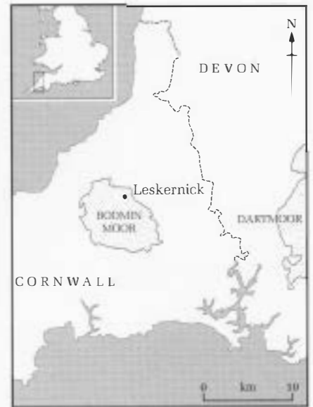
Figure 2 Southwest England showing the location of the granitic massifs of Dartmoor and Bodmin Moor, and the site of Leskernick.

project is to monitor the sociology and interpretive processes involved in our work on the Moor. 2 Our interpretations of Leskernick are a product of many people with differing experiences of the site. We have documented these, in part, by keeping and publishing personal diaries, and by encouraging open dialogue on our web site mailbox. 3