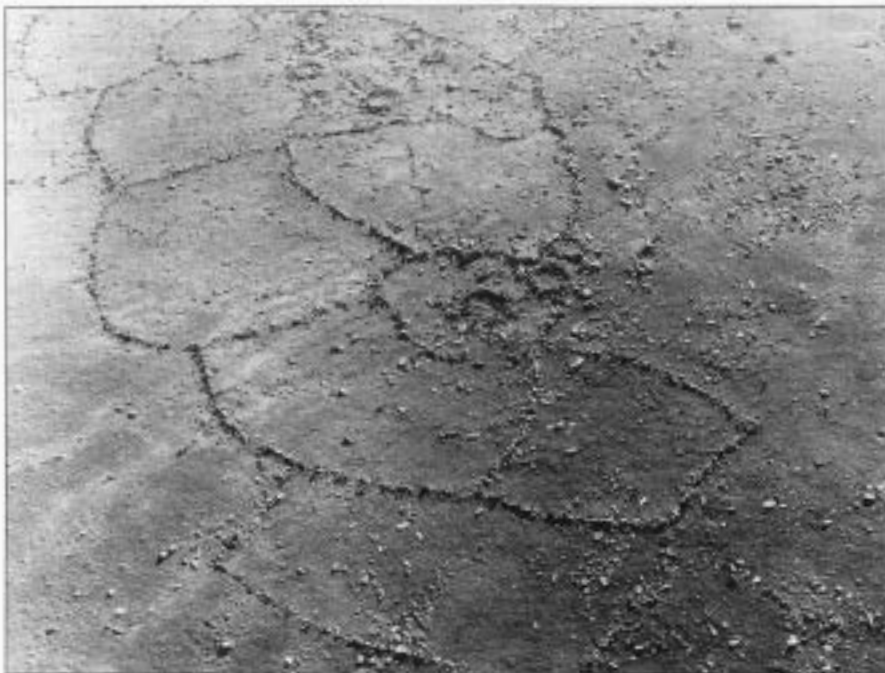
Figure 1 Oblique aerial photograph of part of the southern settlement and enclosures at Leskernick; view northeast, February 1979.

Leskernick Hill, which today is common grazing land, lies far from roads and tracks. It is an oval hill only 327 m high, enclosed on all sides by higher hills (Fig. 3). On the western side, these hills are rugged, with distinctive outcrops or tors that breach the skyline (Fig. 4). On Leskernick Hill itself, there are dramatic spreads of granite boulders known as clutter, among which the houses and field systems that comprise the prehistoric settlement complex were placed. The settlement consists of the remains of 50 circular stone-wall houses (Fig. 5) which, together with their associated stone-wall field systems, extend over an area of 21 ha. Capping the hill, above the settlement, there is a dramatic propped stone known as the Quoit. Immediately to the southeast, at the foot of the hill, there is a stone-free plain on which there is a ritual complex consisting of two stone circles, a stone row and a large cairn (Fig. 3).