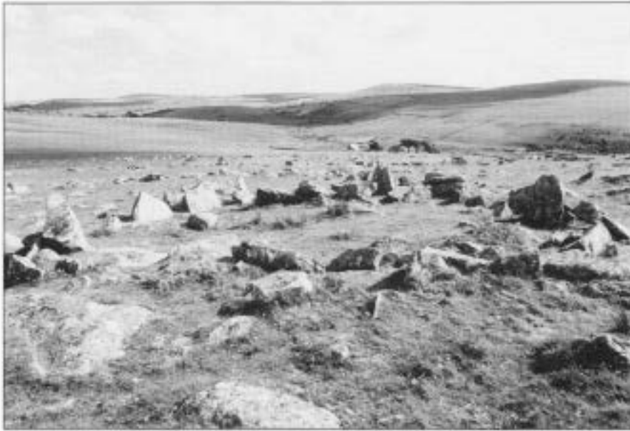
Figure 5 House 29 in the southern settlement at Leskernick.

and preliminary analysis of them suggests that settlement took place in a cleared environment dominated by grassland and heath. No evidence of cereal pollen has been found in the on-site samples. Analysis of charcoal from the Leskernick houses suggests a dominance of oak, which was probably brought to the settlement from woodland in nearby valleys.