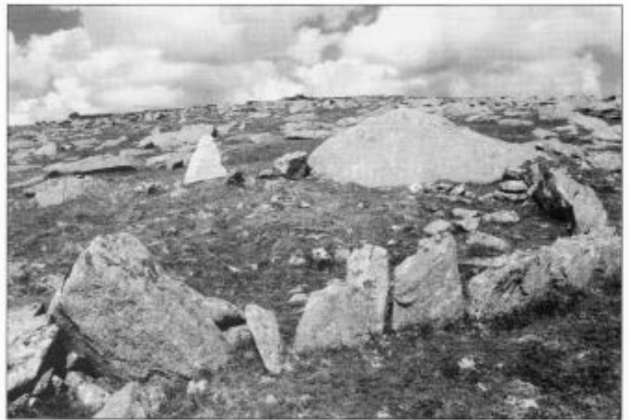
Figure 6 Exterior walls of house 20 at Leskernick with prominent whale-shape backstone opposite the entrance, and triangular stone wrapped in cling film and painted.

Our surface surveys indicate that Leskernick's enclosures and field systems grew in a curvilinear fashion from several centres. The enclosures vary in size from 0.25 to 1.00 ha, and today their walls are 0.6–2.0 m wide and up to 1.2 m high. The enclosure and boundary walls relate closely to the natural patterns of clutter on the hill. The major axes of the clutter flows form the basis of the boundary systems, suggesting that the clutter may have had a pre-existing symbolism. The walls are strung between huge boulders and connect major clutter concentrations (Fig. 7). This could be interpreted as minimizing construction effort by maximizing the local use of naturally embedded rocks, but the walls persistently follow unsensible alignments. Our excavations of seven wall sections indicate that no single wall-building technique was