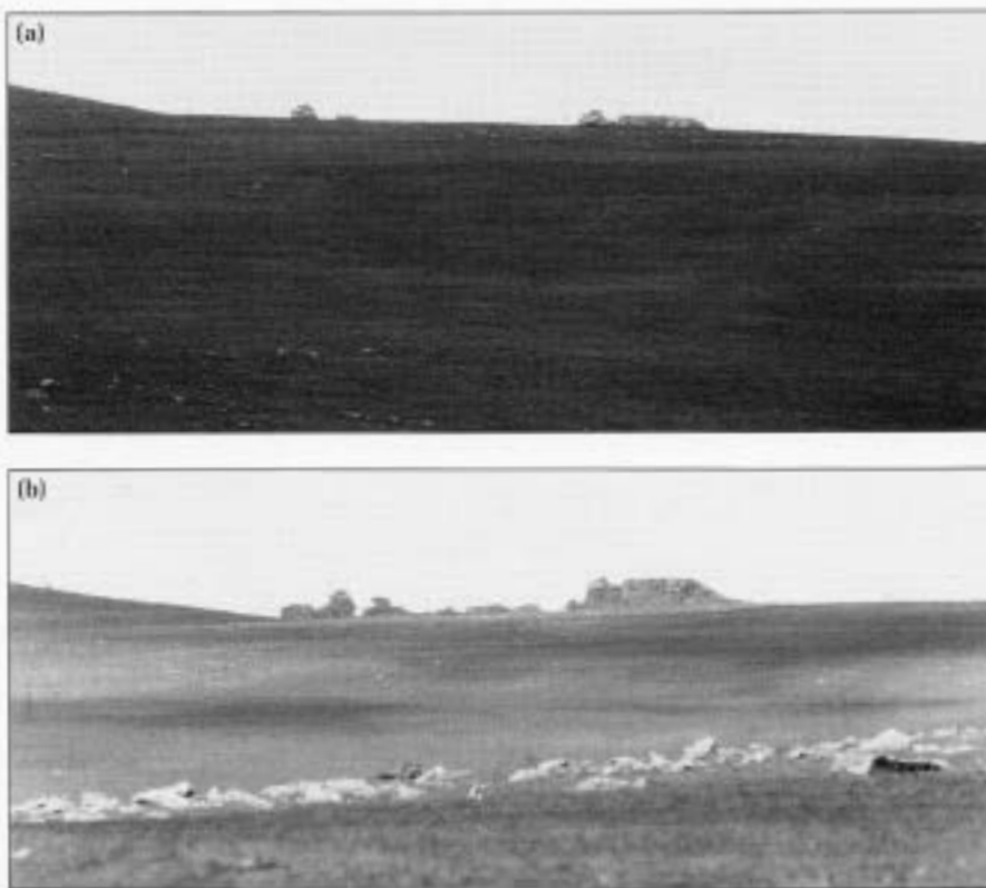
Figure 9 Emergence of Rough Tor on the skyline as one approaches (a) and arrives at (b) the Stone Row Terminal at Leskernick.