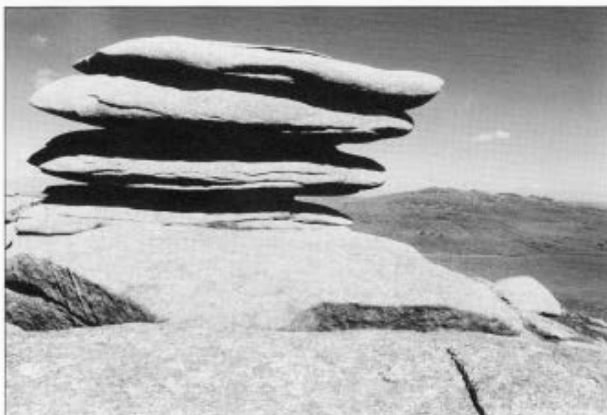
Figure 4 Rough Tor with Brown Willy in the background.

Leskernick Hill is extremely stony and our excavations indicate that its surface