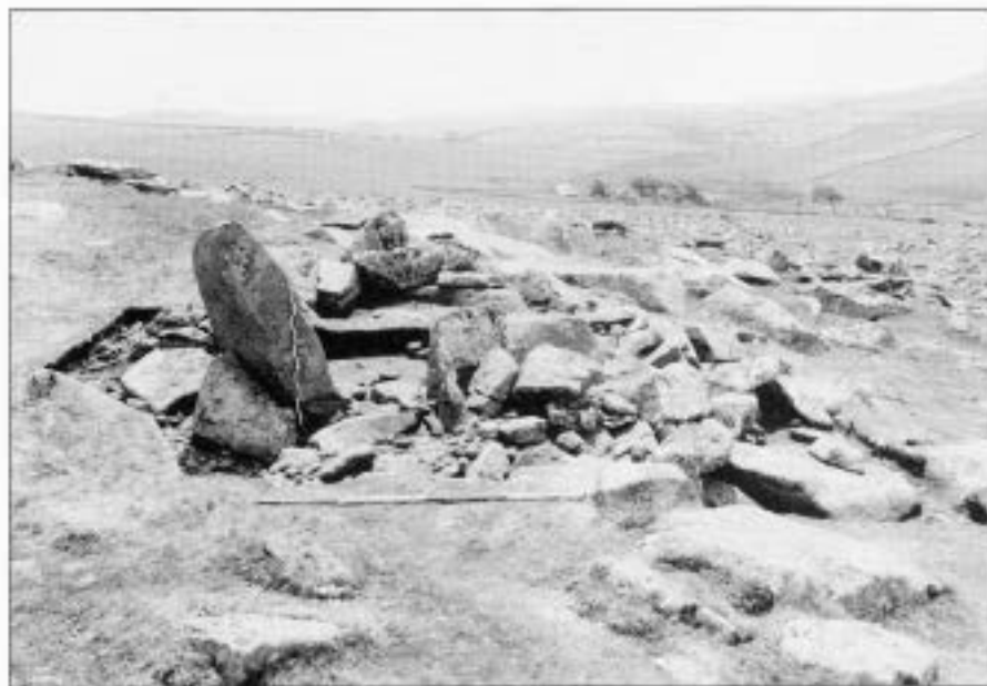
Figure 8 Excavation of structure 23, a circular enclosure that incorporates a triangular clutter upright (against which is a vertical 1 m scale; the horizontal scale is 2 m in length).

Excavation and surface survey therefore suggests a Bronze Age world in which recurrent structural associations are reflected in the houses, walls, cairns and other clutter features of Leskernick. Our surveys of other Bronze Age settlements on the moor have revealed similar patterns of association between landscape features, clutter patterns and the architecture and layout of settlements, which suggest a communal rock-using ideology. 10 This conclusion also suggests that we need to explore regional variability more explicitly in our reconstructions of British Bronze Age societies. These have traditionally been derived from south-central England, where the primary building material was wood, and the landscapes (rounded, undulating chalklands) and economies (field systems of arable agriculture) were very different from those of the granite massifs of the southwest. Our classic Wessex-based view of the British Bronze Age may be just one regional variation. What is clearly distinctive about Leskernick and the Bronze Age settlements of Bodmin Moor is the blurring of the boundaries between the ritual and domestic spheres of life, and between the natural world and the world constructed by humans. Perhaps we should now reconsider the Bronze Age worlds of other regions of Britain in a similar light.