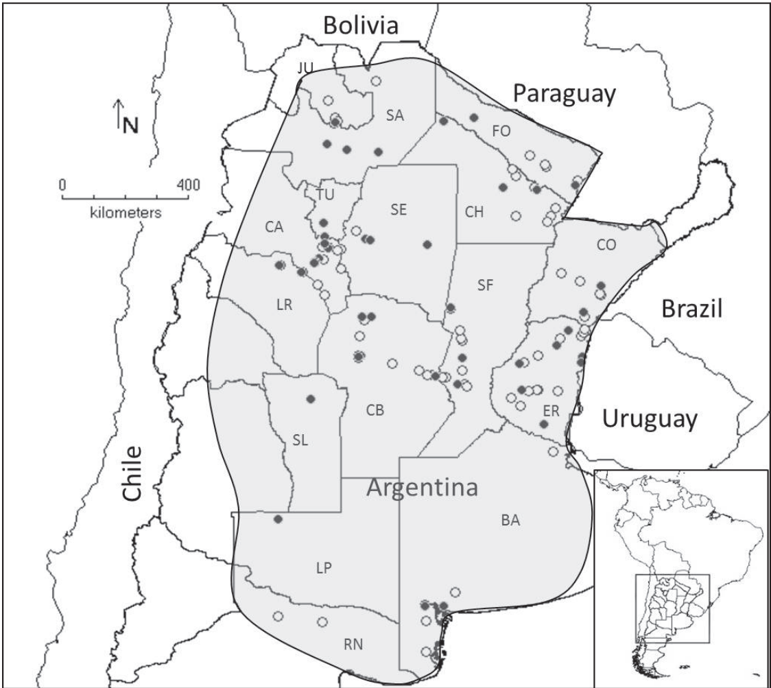
Fig. 2. Distribution of Apanteles opuntiarum which emerged from Cactoblastis cactorum larvae (black circles) and locations where A. opuntiarum did not emerge from C. cactorum larvae (white circles) collected in the Argentina provinces of Buenos Aires (BA), Catamarca (CA), Córdoba (CB), Chaco (CH), Corrientes (CO), Entre Ríos (ER), Formosa (FO), Jujuy (JU), La Pampa (LP), La Rioja (LR), Río Negro (RN), Salta (SA), Santiago del Estero (SE), Santa Fe (SF), San Luis (SL), and Tucumán (TU). Shaded area indicates surveyed region.

conditions, such as host and parasitoid densities, and source of the females. The highest success was obtained with 30 host larvae exposed to parasitism by two field-collected female wasps. Increasing host larval numbers ( n = 50 ) did not translate into higher reproductive success, and decreasing host larval numbers ( n = 10 ) negatively impacted the reproductive success of A. opuntiarum . At this lowest density, many host larvae died in earliest instar stages, probably because of superparasitism or numerous stings. Although field-collected females had a similar attack rate as laboratory-reared females, the former produced a greater number of offspring and produced both males and females, essential to the continuity of a laboratory culture.