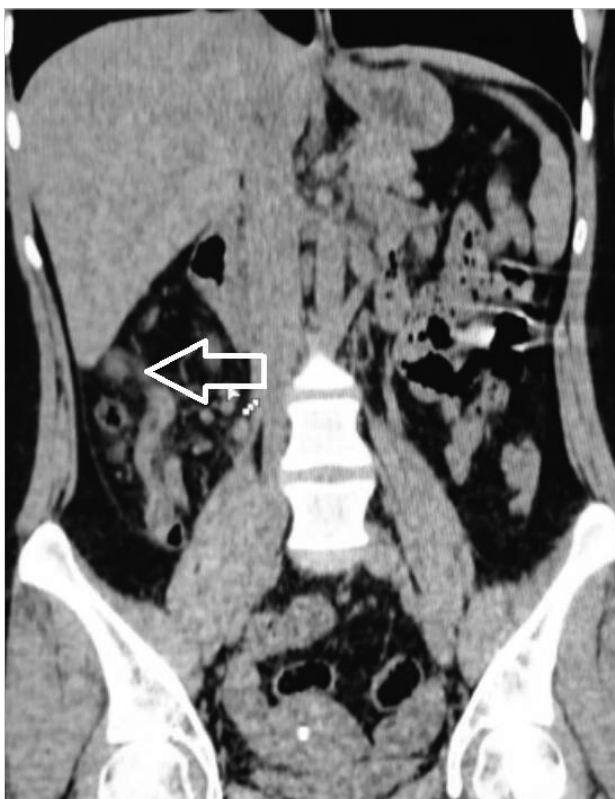
Figure 2. Appendix tissue extension into the liver

A signed written informed consent was taken from the patient.