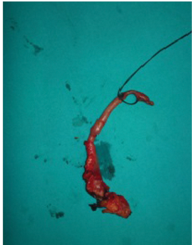
Figure 3. The phlegmonous end portion of the appendix tissue

However, in adults, it is indicated that non-contrast CT is superior to USG and CT decreases the false laparotomy rates (13). When clinically, gallbladder, hepatobiliary, or urinary tract pathologies are suspected in patients in the emergency departments, USG is frequently performed. With this in