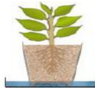
Fig 2. Different non-circulating methods (a) Root dipping technique, (b) Floating technique, (c) Capillary action technique [4]

Suitable vessels for static systems include polythene beakers, pots, glass jar and containers lined with black polythene film.