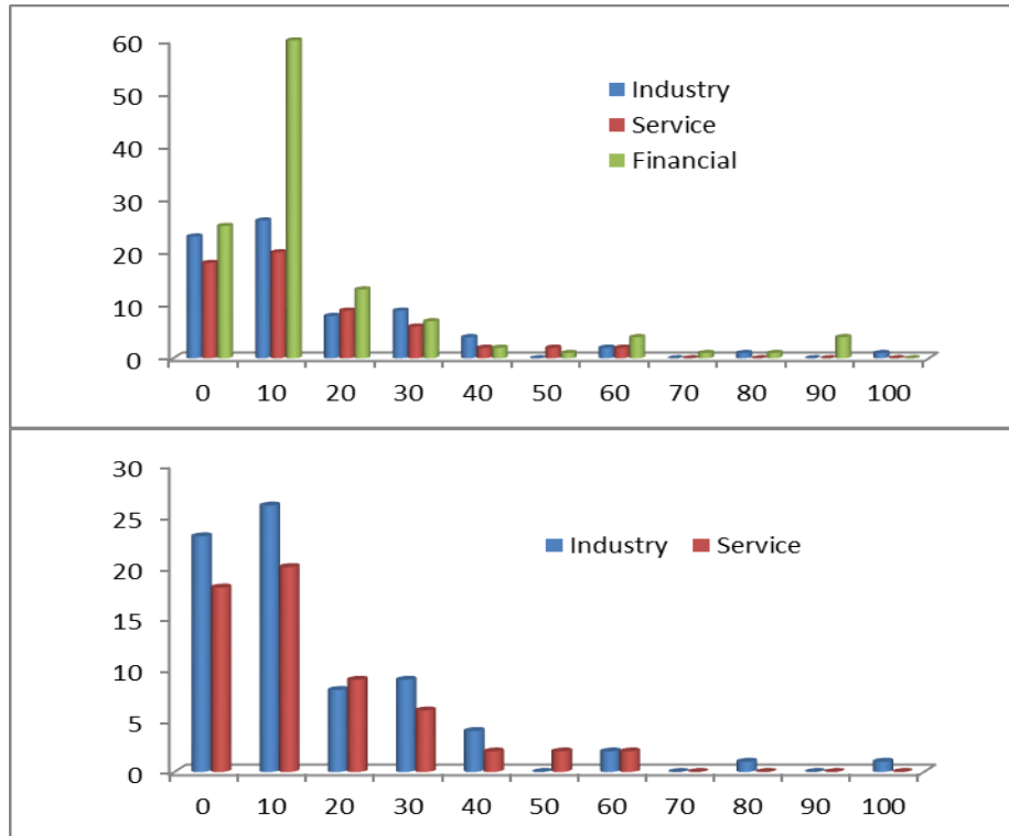
Figure 3 Frequency of the highest percentage of foreign ownership that exceeds 1%

Source of data: http://www.ase.com.jo/en/equities , and from there for each individual listed company, information about shareholders can be obtained. Zero represent that there is no foreign ownership that exceeds 1% in this company.