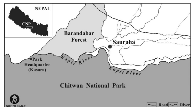
Figure 1 Diagrammatic map of study area (not to scale). CNP = Chitwan National Park.

Purposive sampling was used to select the villages incorporated in this research to evaluate spatial distribution.