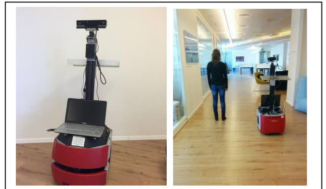
Figure 1. Experimental setup and dedicated person-following robot.

This research was supported by the Ministry of Science, Technology & Space, Israel, Grant # 3-12060, "Follow me", by the EU funded Innovative Training Network (ITN) in the Marie Skłodowska-Curie Programme (Horizon2020): SOCRATES (Social Cognitive Robotics in a European Society training research network), grant agreement number: 721619 and partially supported by the Helmsley Charitable Trust through the Agricultural, Biological and Cognitive Robotics Center, the Marcus Endowment fund and by the Rabbi W. Gunther Plaut Chair in Manufacturing Engineering, George