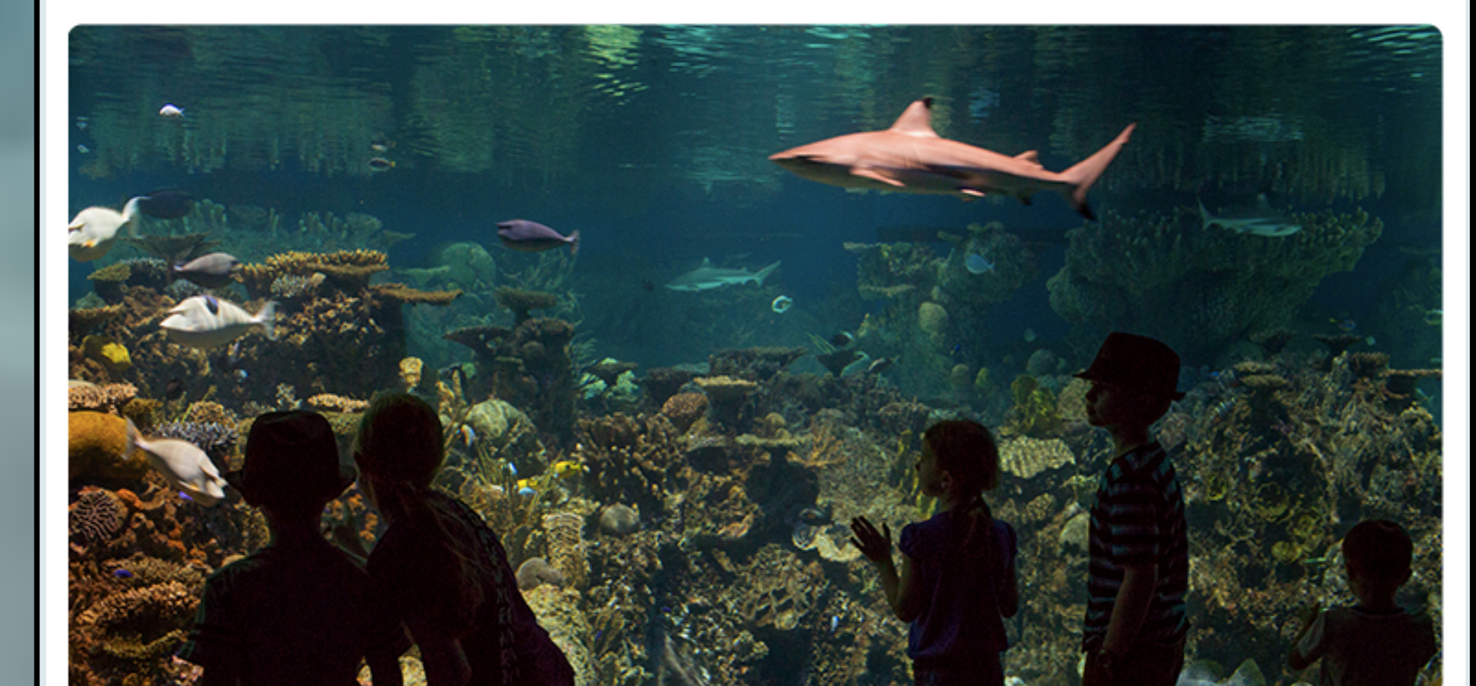
the aquarium's Blacktip Reef exhibit