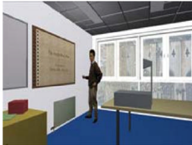
Figure 1 The real seminar room and the computer graphics environment.