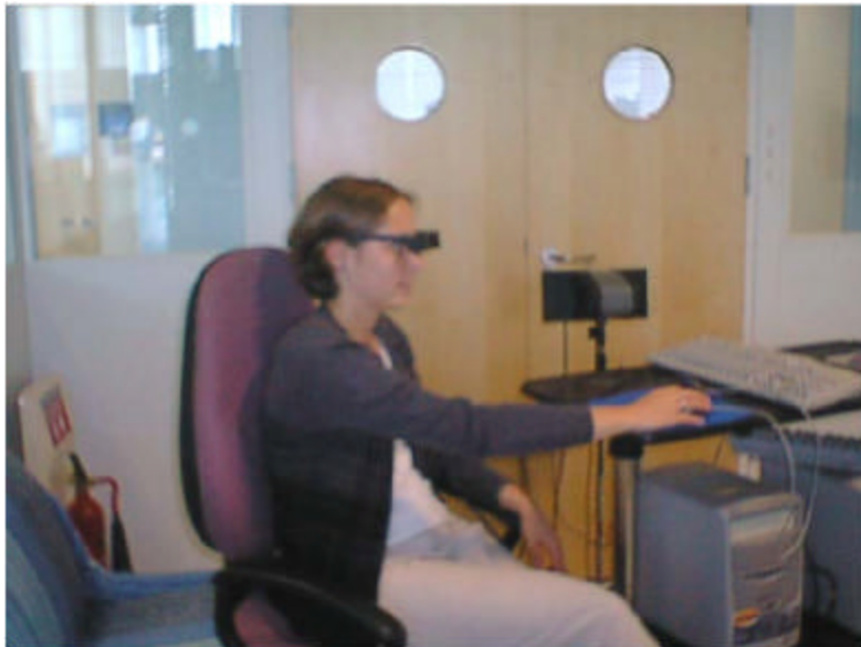
Figure 3 Experimental set-up for the HMD condition (HP Laboratories, Bristol).