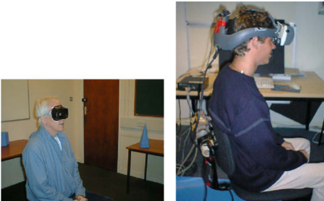
Figure 5 The real-world and HMD mono/stereo condition (head-tracked).