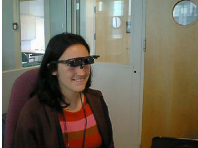
Figure 2 The Hewlett Packard Laboratories HMD prototype.