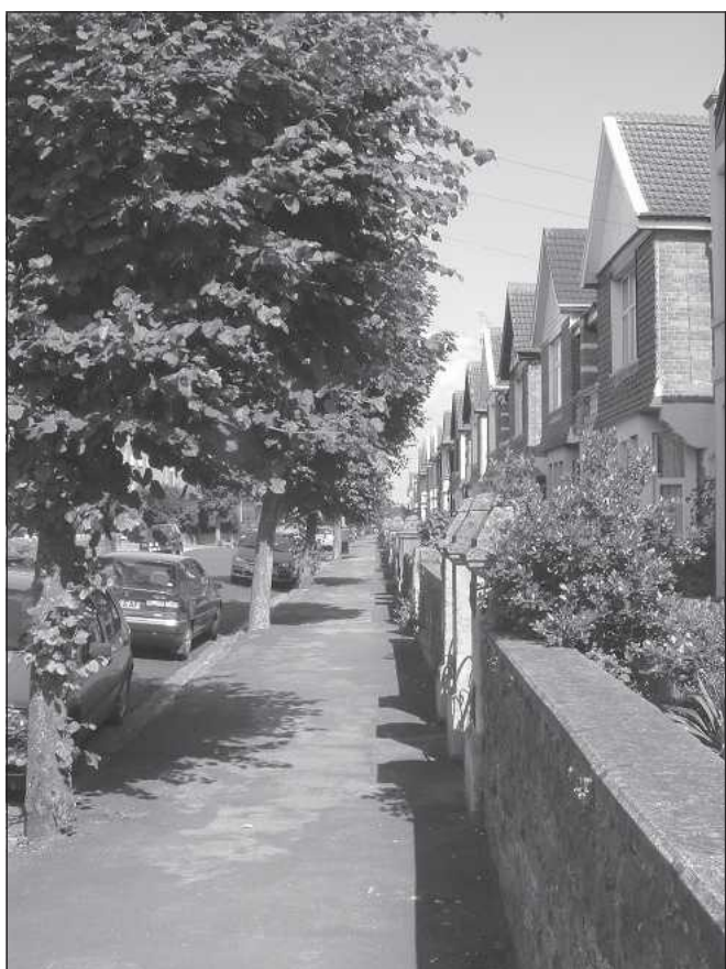
Figure 2. Pollarded street trees in North Somerset, UK.

Although differences between the educational systems in the United States and Britain make a precise comparison difficult, the educational levels of the two groups did appear to be roughly comparable. A high school diploma in the United States, usually obtained at age 17 or 18, corresponds approximately to the GCSE, CSE, and O levels in England, which are attained at age 16. In the Downers Grove survey, 84% of respondents had completed this level and gone on to at least some additional education in college or technical school compared with 70% in the North Somerset/Torbay survey. Graduate school in the United States is equivalent to postgraduate education in the United Kingdom. In the Downers Grove survey, 30% had at least some education at this higher level compared with 26% in the North Somerset/Torbay survey.