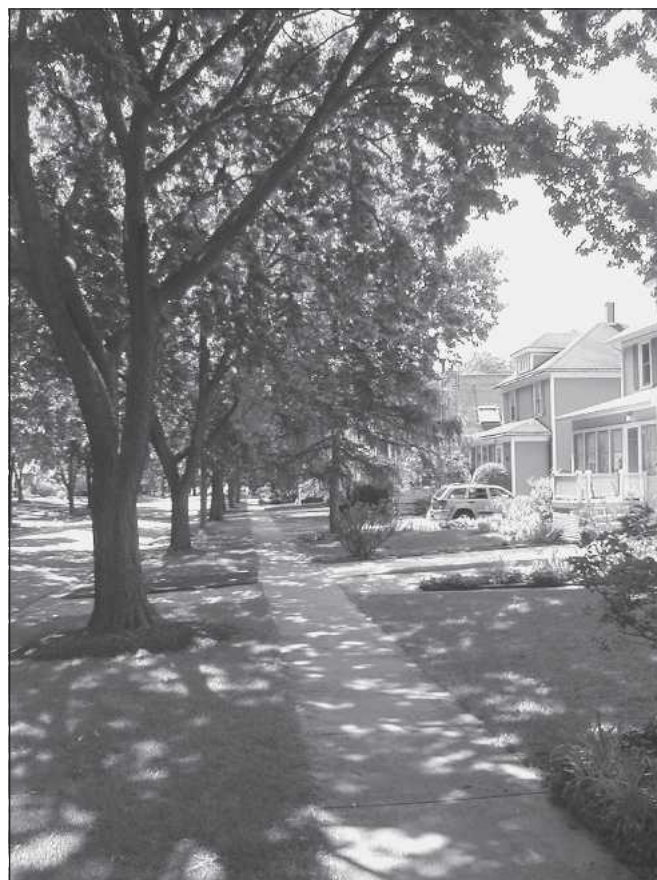
Figure 1. Street trees in Downers Grove, Illinois, U.S.

Despite the modifications to the survey questionnaire, most of the questions on Flannigan's survey were substantially the same as on Schroeder and Ruffolo's. We combined the corresponding survey responses from the three communities to create a single data set, which we used to compare responses from North Somerset and Torbay with those from Downers Grove. (For survey items on which the wordings varied between the surveys, the British wordings are used in the presentation of results subsequently.) It should be noted that because the respondents of these surveys were not randomly sampled from their respective nations, the results of these comparisons do not necessarily correspond to general differences between the populations of the United Kingdom and the United States.