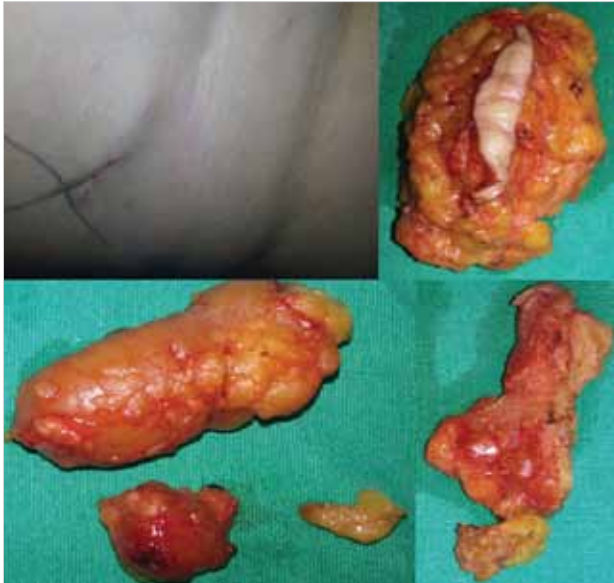
Figure 1. Old appendectomy scar and resected specimen, cicatricial, mass and lymph nodes