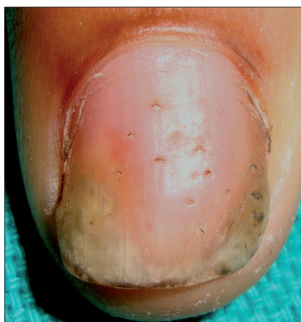
Figure 3: Pitting, onycholysis and salmon patch

Out of 48 patients with psoriatic nail change, evidence of onychomycosis as per the diagnostic criteria was found in 23 patients (47.91%) [Table 1]. Fungal culture grew only non-dermatophytic molds and yeast like fungi (9/48, 18.75% each) [Table 2]. No statistical