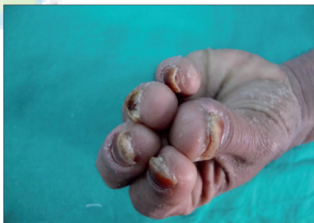
Figure 4: Subungual hyperkeratosis involving the fingernails