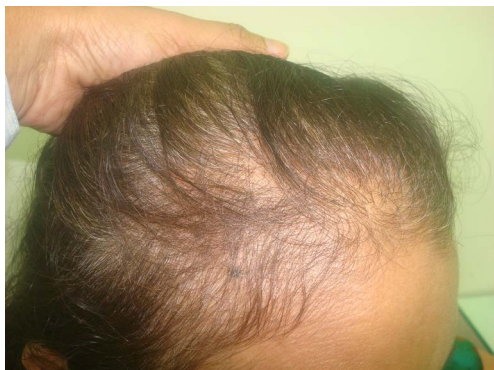
Figure 5a: Hair loss in a female architect working in dust and cement.