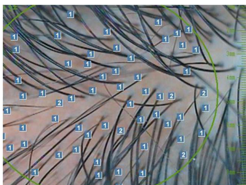
Figure 1b: Trichoscopic hair counts showing 24% improvement after 4 months of care program.