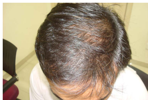
Figure 4b: Improved hair growth in 4 months with antioxidant therapy and hair care program.