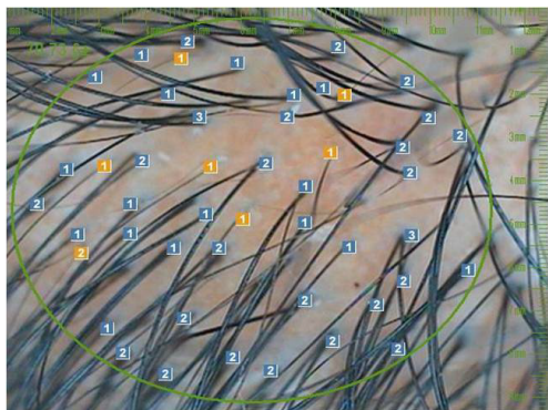
Figure 1a: Trichoscopic hair counts before treatment.