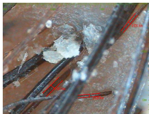
Figure 2a: Trichoscopic evaluation of dandruff and hair caliber before treatment.

Unusual case of hair loss from effects of electromagnetic radiation from a cell phone: