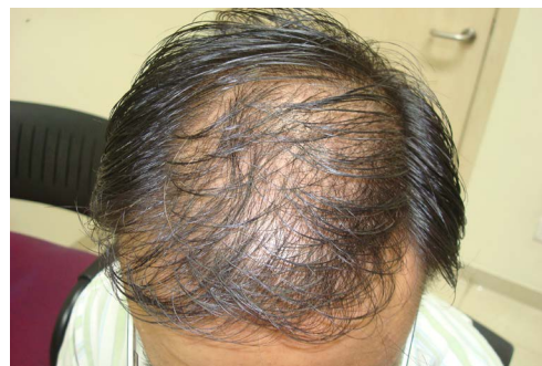
Figure 4a: Hair loss in a person working on Petroleum transport ship.

Philpott demonstrated in his experiments that pollution levels increase oxidative stress on the hair follicle cells, leading to increased hair shedding, similar to the mechanism seen in persons suffering from androgenic alopecia (AA) [18]. Which implies that pollution induced