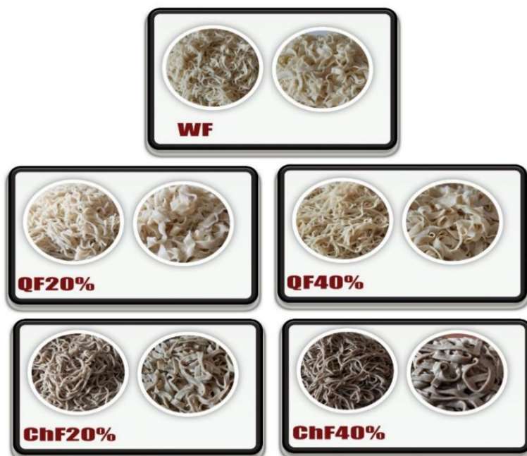
Figure (5): photo of pasta after cooking

The product might be likable without good taste, so this product is potentially to be unacceptable. Taste is a major parameter when evaluating the sensory properties of food products (Muhimbula et al. , 2011). For the value of taste, there was a significant difference between the control sample WF and other samples prepared with QF and ChF ( p \leq 0.05 ). The samples QF and ChF 40% had taste value 8.95 and 8.80% respectively, while sample prepared by QF and ChF 20% had the lowest value of taste (8.65 and 8.75%) respectively. The samples with QF were more perfect than the samples with ChF and were found that increased levels of QF in pasta from 20 to 40% increased score of taste. Results are agreed with (Torres Vargas et al. , 2021) reported that the sensory assessment of