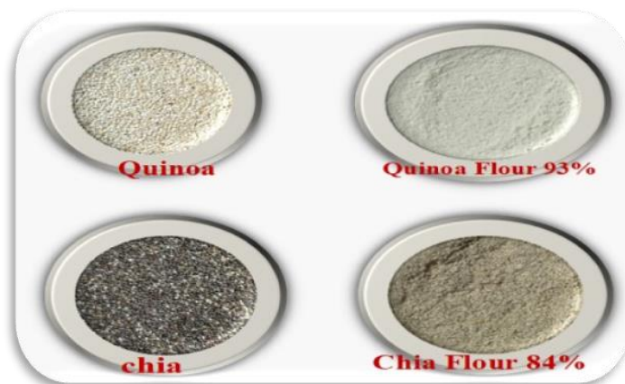
Figure (1): Photo of (quinoa and chia) seed & flour Chemicals

Wheat flour 72%, chia, quinoa seeds and the rest ingredients were obtained from Aswaq Misr market, Minia City, Minia Governorate, Egypt.