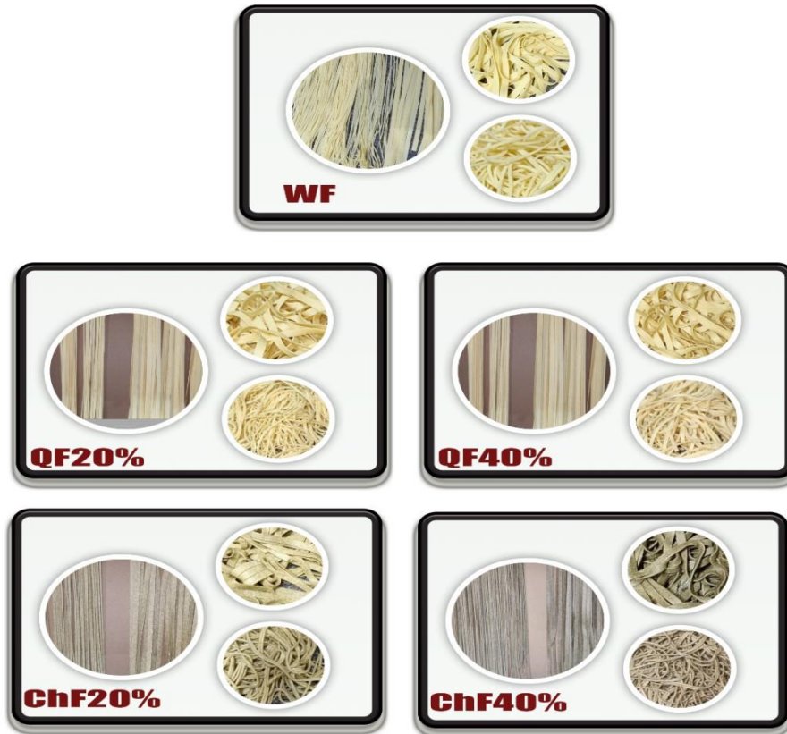
Figure (2): Photo of fresh pasta