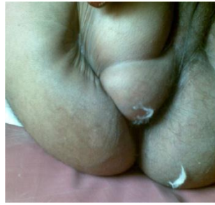
Fig. 7. Extensive scar of surgery.

Though the result of ksharsutra therapy has been excellent, yet there have been many problems associated with the therapy such as longer duration, discomfort in that duration, delayed healing etc.