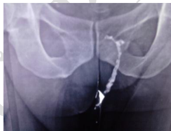
Fig. 2. Fistulogram of intersphincteric fistula.