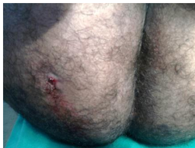
Fig. 3. Transphincteric fistula with gluteal region opening.

In this variety of fistula, the track crosses both internal and external sphincter before opening in peri-anal skin.