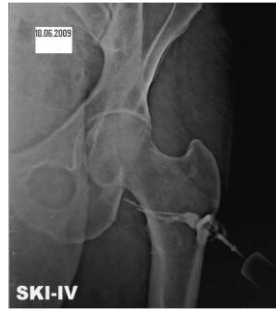
Fig. 4 Fistulogram of transphincteric fistula.