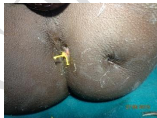
Fig. 10. Healing of the primary wound in interceptive technique.

Duration of therapy; hence, morbidity was significantly less in group B patients. The discharge was reduced very early in group B. Wound size was small and scar was significantly less in group B patients. Pain was also less in group B patients.