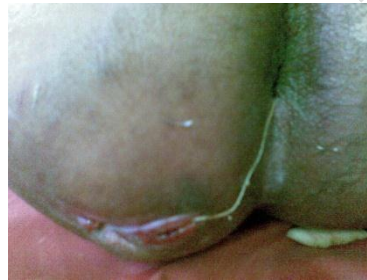
Fig. 12. Granulation and discharge from wound even after 3 months of conventional ksharsutra therapy.

Contrary to the interceptive therapy, conventional therapy was associated with morbidity, discharge, wound and large scar. There was need of wound toileting, nursing and modifying lifestyle. Granulation tissue formation was another disadvantage owing to large track.