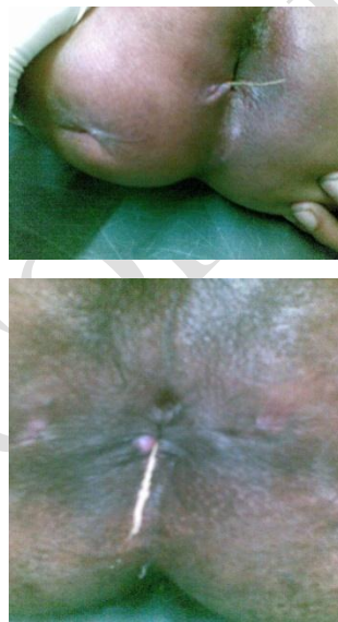
Fig. 14. Results of interceptive technique.

The duration of treatment, discharge, morbidity were significantly less in group B patients. There are a few illustration of interceptive approach.