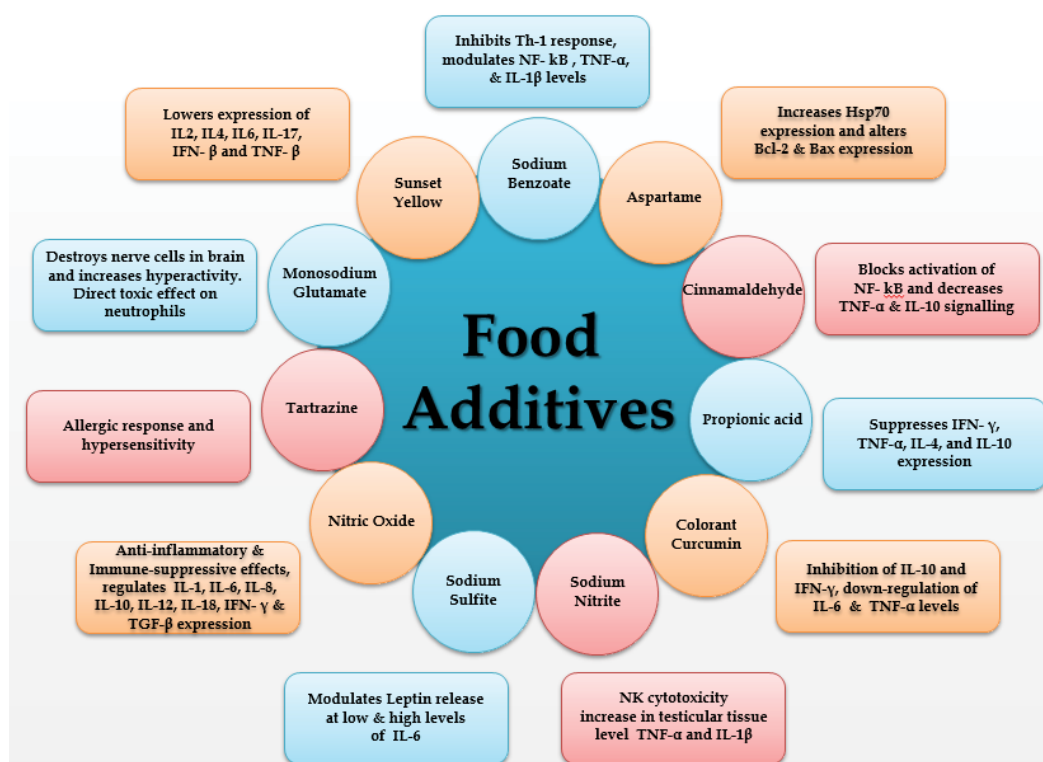
Figure 2: Immunomodulatory properties of Food Additives.