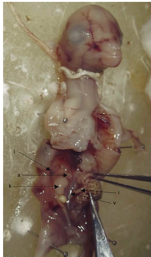
Fig. 3. Photograph of 60 days old goat foetus showing right adrenal gland (a), kidney (k), intestine (i), vena cava (v) and part of liver (l).

times from the group- II in group- III. The length of right adrenal gland increased from 4.50 mm to 6.75 mm, width increased from 2.69 mm to 4.59 mm, thickness increased from 1.89 mm to 2.93 mm and weight increased from 15.75