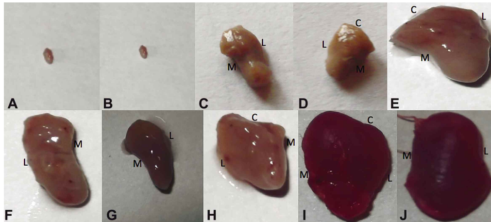
Fig. 1. A. Photograph of left adrenal gland of 50 days old goat foetus; B. Right adrenal gland of 50 days old goat foetus; C. Left adrenal gland (cranial view) of 100 days old goat foetus showing borders medial (M) and lateral (L); D. Right adrenal gland (caudal view) of 100 days old goat foetus showing borders cranial (C), medial (M) and lateral (L); E. Right adrenal gland (cranial view) of 101 days old goat foetus showing borders cranial (C), medial (M) and lateral (L); F. Left adrenal gland (caudal view) of 101 days old goat foetus showing borders medial (M) and lateral (L); G. Left adrenal gland (cranial view) of 118 days old goat foetus showing borders medial (M) and lateral (L); H. Right adrenal gland (caudal view) of 118 days old goat foetus showing borders cranial (C), medial (M) and lateral (L); I. Left adrenal gland (cranial view) of full term goat foetus showing borders medial (M) and lateral (L); J. Right adrenal gland (cranial view) of full term goat foetus showing borders cranial (C), medial (M) and lateral (L).