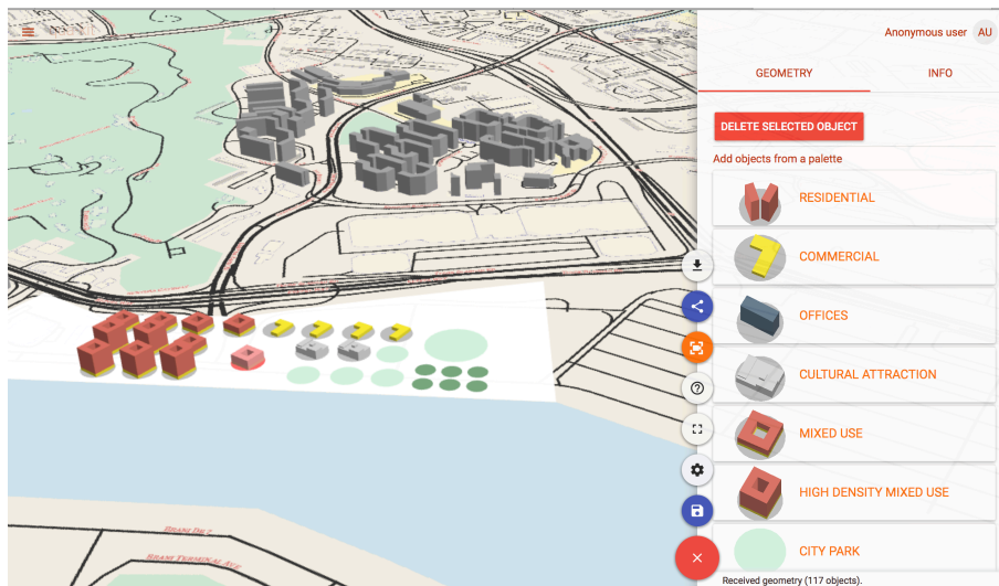
Figure 1. The interface of the qua-kit tool. .

edit 3D geometries in a 3D environment. The tool supports 3D elements with a base map. The 3D elements can be customised, depending on the nature of the exercise, and they can be picked by users, located in a specific spot and rotated. The 3D elements cannot be resized or modified. The tool records the spatial configuration submitted by the users, together with camera zooms, movements and frequency of elements used. The majority of guidelines and instructions about the use of the tools were presented to participants on the website ( https://ideasfortanjongpagar.com ), while the tool itself has a simple toolbox, which includes a legend with a description of the 3D element selected and a list of all the 3D elements available with reference images (Fig. 1). After completing and submitting the proposal, each participant is asked to answer some questions regarding specifications and details of his design and general information such as gender, education level and age range.