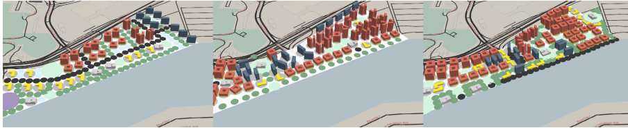
Figure 2. Three examples of participant proposals. They all respond consistently to the coastline, proposing a linear park or open paved public space. They also react to the park connector North West.