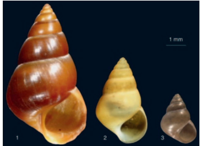
Figure 4 Assimineea spp.: 1 Assimineea mesopotamica ; 2 A. zubairensis n. sp.; 3 A. nitida.