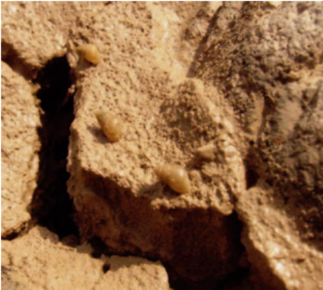
Figure 3 Assimineea zubairensis in its habitat.