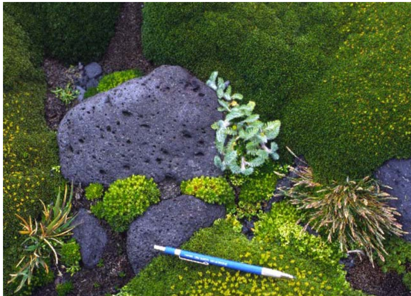
Fig. 2 L. plumosa plant in situ between small boulder and Azorella selago cushion. Other species are Colobanthus kerguelensis (lower edge of boulder), Poa cookii (lower left corner of boulder), Montia fontana and Poa kerguelensis (lower right corner of boulder). Pencil length = 15 cm.

largely due to differences in microhabitat, as plants growing in sheltered positions are larger and more luxuriant, while those in exposed conditions are dwarfed (Chastain 1958; Huntley 1971; Gremmen 1981; Flora of Australia 1993; Smith and Steenkamp 2001). The indumentum is variable between plants and somewhat variable between different islands but no consistent differences have been identified.