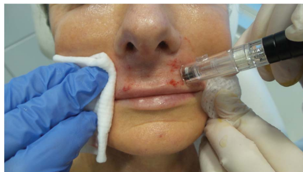
Figure 1. Microneedling device is placed perpendicular to the skin's surface with a thin layer of hyaluronic acid gel. Manual skin traction facilitates smooth gliding of hand-piece and uniform delivery of microneedles across the skin.

Depending on the specific location to be treated, it is often helpful to divide the region into quadrants. For