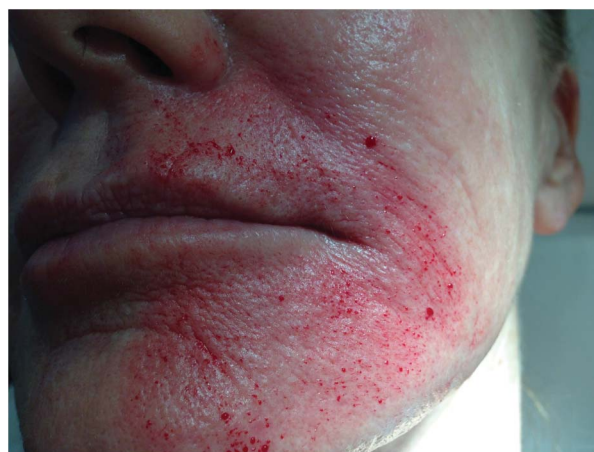
Figure 2. Pinpoint bleeding serves as a guide to indicate treatment end point.

example, when treating the perioral region, the left upper, left lower, right upper, and right lower regions can be treated individually for more precise and uniform microneedling coverage. Gentle traction of the skin with one hand while simultaneously lowering the microneedling device perpendicular to the skin with the other hand assists the smooth delivery of microneedles into the skin (Figure 1). It is important to apply sufficient hyaluronic gel (supplied by the device company) on the treatment area surface to facilitate the gliding action of the microneedling device and to prevent untoward injury to the overlying epidermis. The treatment technique involves a combination of horizontal, vertical, and oblique device passes over the treatment areas, repeating approximately 3 to 6 times or until fine pinpoint bleeding is observed (Figure 2). When treating deep rhytides or scars, a "rocking" or