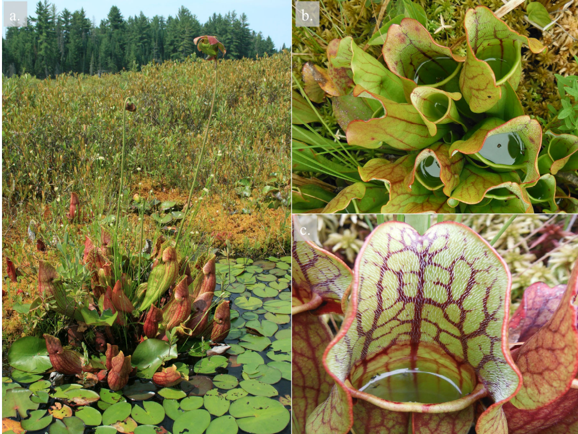
FIG. S2. Northern pitcher plant ( Sarracenia purpurea purpurea ) in bog habitat of Algonquin Provincial Park, Canada. a. Plant in flower demonstrating a full rosette of pitchers at the fringe of a Sphagnum bog mat; b. Above view of a pitcher cluster; c. Close-up of a pitcher mouth aperture and pitcher hood, showing downward pointing hairs to prevent prey escape.