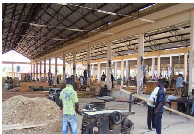
Fig. 1 Wood workers at the SWV, Kumasi

Geographically, the SWV is located in the Nhyeaso Sub-Metropolitan Area of the Kumasi Metropolis (see Fig. 2). This ultra-modern wood village occupies about 12 hectares and was designed to accommodate about 4,790 workers engaged in wood related SMEs. The construction of the facility was jointly funded by the French and Ghanaian governments at a cost of about US$10 million [17], [18]. The objective of SWV development was to enhance the productivity, the working and the living conditions of the wood workers [18]. Available facilities and services in the SWV include electricity, pipe borne water, toilet facilities, road networks, a health post, a security post, a bank and an insurance firm.